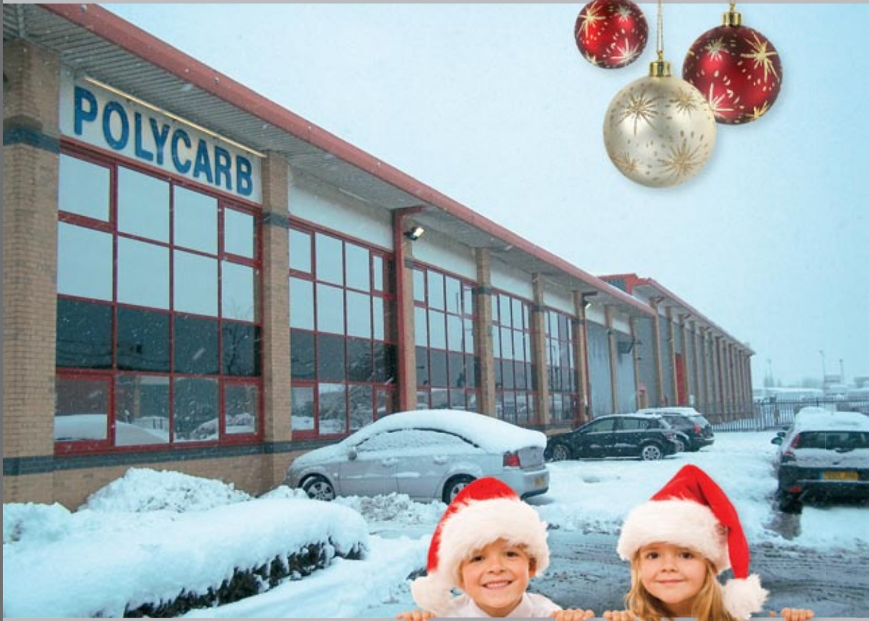
Palram Polycarb UK plant covered with snow.